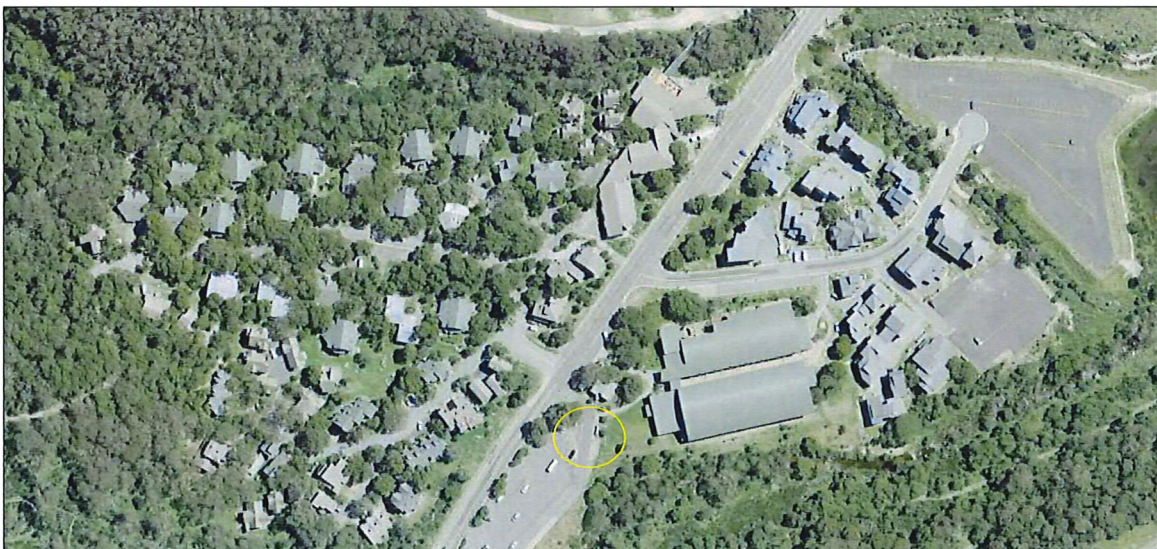
Figure 1: Location of approved facility (circled) in context of Thredbo

The Eagles Nest site is located on an existing telecommunications structure along with other telecommunication providers.